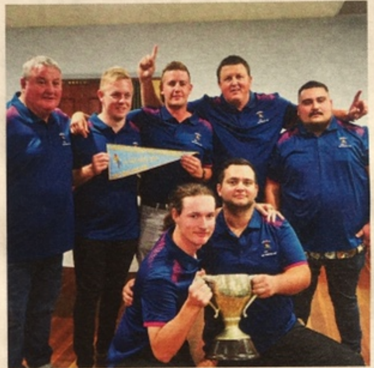
WINNERS ARE GRINNERS: THE VICTORIOUS BRANXTON GOLF CLUB'S A GRADE PENNANT TEAM.